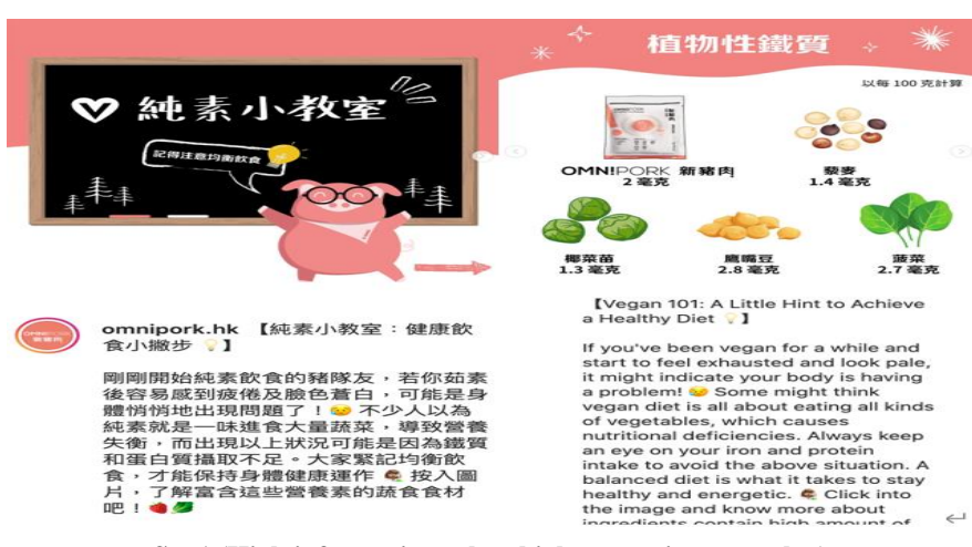
Set 1 (High informative value, high entertainment value)

According to Hootsuite in 2021, Instagram's potential advertising reach is 1.16 billion users (19%) who are aged 13