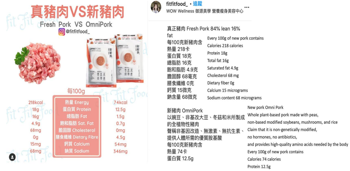
Set 2 (High informative value, low entertainment value)

questionnaire, the respondents are presented with an Instagram post from one of the four scenario (high or low) informative value and (high or low) entertainment value as shown in Figure 2. Using quota sampling as the sampling method, our sample size is 400 people who are evenly divided into four scenarios, that is 100 respondents per set.