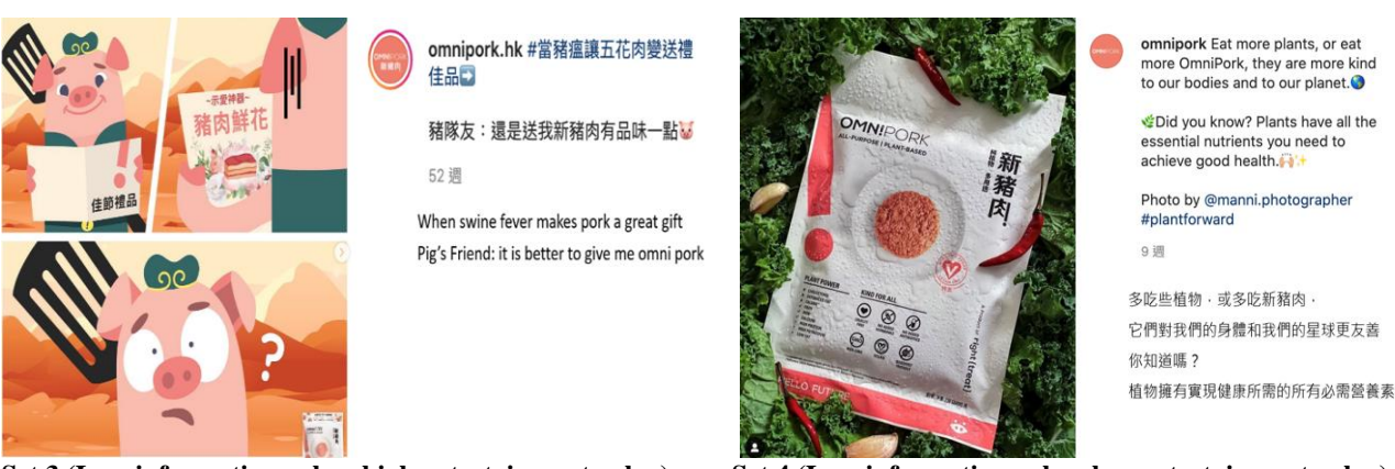
Set 3 (Low information value, high entertainment value) Set 4 (Low information value, low entertainment value) Figure 2: Four scenarios for experimental setting

In order to reach the sampling target and ensure the respondents are Instagram users, we sent our questionnaire to students in a renowned university in Hong Kong. The students are encouraged to post the link in their Instagram profile so that their followers are able to participate in the survey. Moreover, the students are also encouraged to send the link to their friends and relatives via various instant messaging means such as WhatsApp and WeChat. The respondents are being informed that their personal information will be stringently kept confidential.